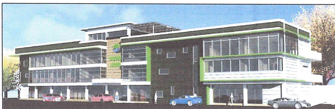
Figure 15. Perspective of EMB-7 Ecological Center and Central Laboratory