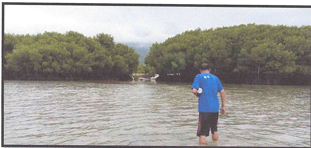
Water Quality Sampling activity.

For 2022, EMB-7 plans to start the designation process thru a series of monitoring and sampling as well as conducting various public consultation around the communities covered by Loboc River.